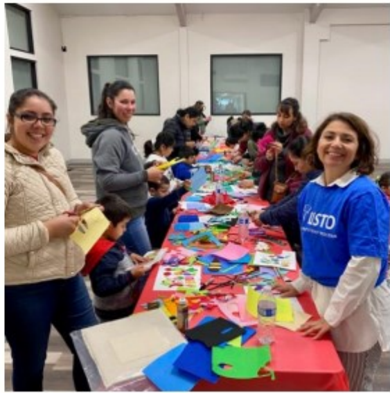
Now each family has their own story board so they can create new adventures for the hungry caterpillar at home!