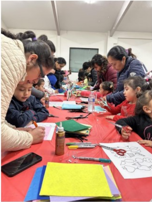
Everyone is in creative mode making their own felt storyboards!