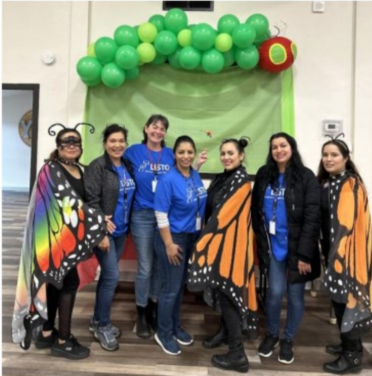
Some of the LISTO Family Literacy Team on hand for the preschool event held at the Roberts Road YMCA.

17 Families (10 Adults and 37 children) On April 6, LISTO hosted a delightful reading and crafting afternoon at the YMCA's Roberts Road Facility. We kicked off the event by reading Eric Carle's "La Oruga Muy Hambrienta/The Very Hungry Caterpillar." After the story and a little dancing, we had some snacks. Families enjoyed creating their own felt story board and getting to know each other! Many of our staff wore costumes!