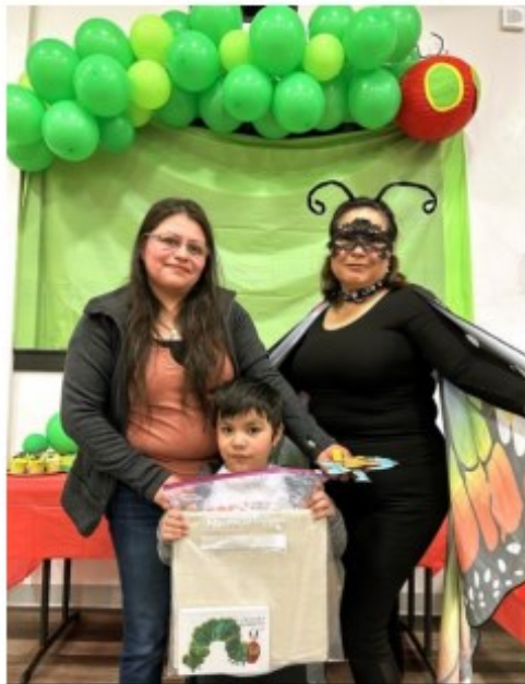
Each participating family received their own copy of the book!