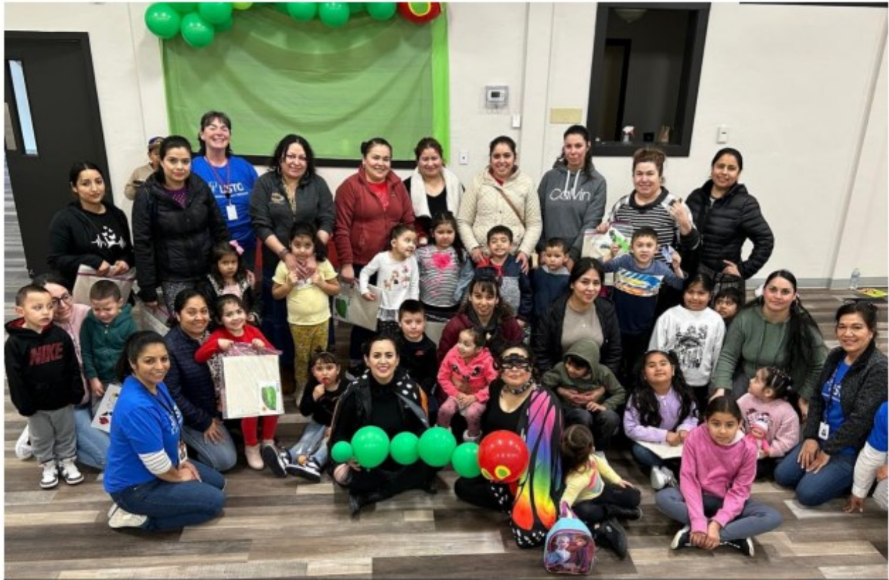
Some of the beautiful families who are part of the LISTO Family Literacy Program. Many thanks to all who support these wonderful people who are so committed to learning together as families.