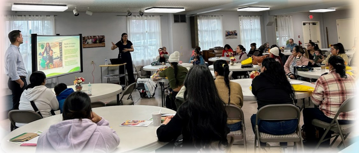
21 LISTO parents and many LISTO staff members attended this important community event.