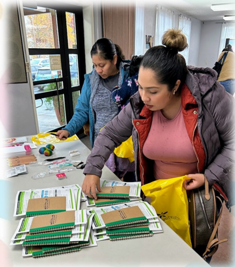
Our community partners ALL Care, Jackson Care Connect, and Southern Oregon Early Learning Services offered LISTO parents a warm welcome and a delicious lunch at their listening session!