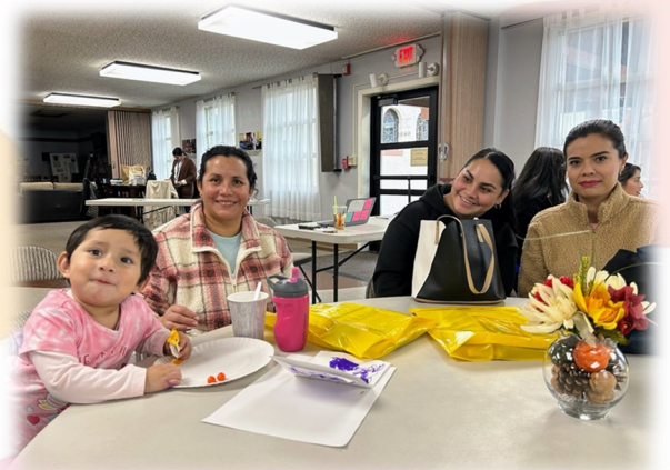
LISTO parents came to share with the community about one of their highest priorities, the social-emotional health of their children.